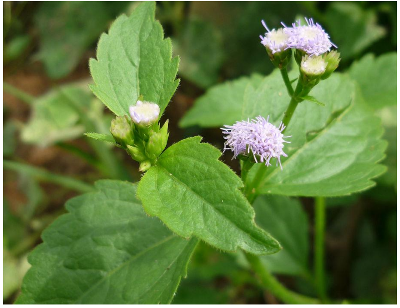
Fig.1: Ageratum conyzoides L.

Total phenol, flavonoids, ascorbic acid and carotenoids contents of chromatographically separated fractions of powdered leaves of A. conyzoides L. are listed in Table -2. It appears from the table that maximum amounts of total phenol (58 mg/mg dry wt), flavonoids (88 mg/mg dry wt), ascorbic acid (22 mg/g dry wt) and carotenoids (25 mg/g dry wt) were present in fourth fraction of chromatographically separated fractions of powdered leaves of A. conyzoides L.