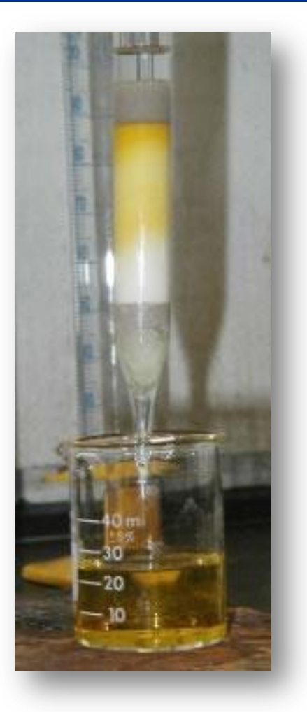
Fig. 2: Bands separation in Silica gel G column chromatography Table 2: Total phenol, flavonoids, ascorbic acid and carotenoids content of chromatographically separated fractions of powdered leaves of A. conyzoides L.