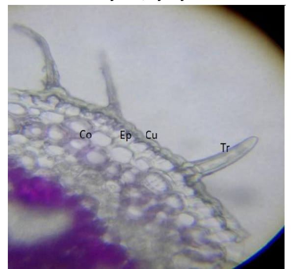
Figure 2: Epidermal cells showed that are single-celled, blunted, thick-walled covering trichomes. Tr: Covering Trichomes, Cu: Cuticle, Ep: Epidermis, Co: Collenchyma